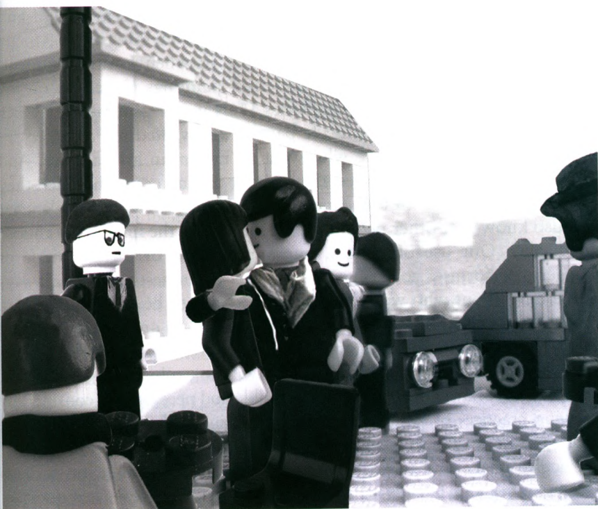
Figure 2.5 Copia d'arte lego – homage Robert Doisneau, by Marco Pece alias Udronotto, created in 2008 and downloaded from Flickr in 2010