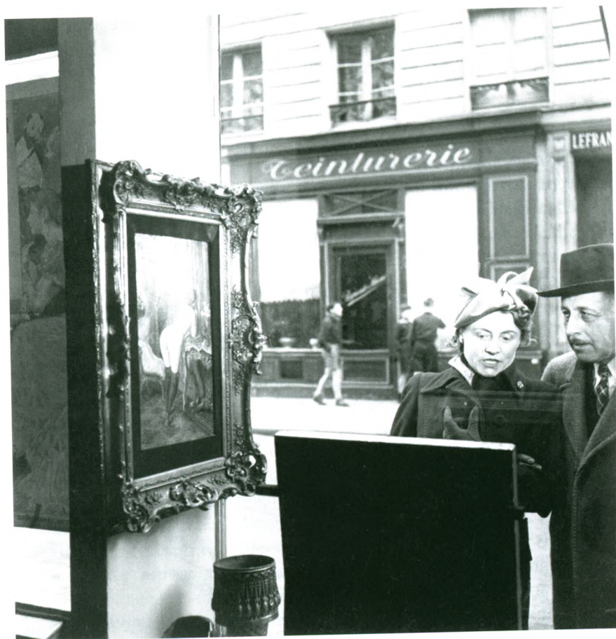
Figure 2.2

photograph as a snapshot of real life, then, more because we expect photos to show us snippets of truth than because they actually do. This photo might have been posed: the photographer who took this one certainly posed others, which nevertheless have the same 'real' look (Doisneau 1991). Also, as Griselda Pollock (1988: 85–7) points out in her discussion of this photograph, its status as a snapshot of real life is also established in part by its content, especially the boys playing in the street, just out of focus; surely if it had been posed those boys would have been in focus? Thus the apparently technological effects on the production of a visual image need careful consideration, because some may not be straightforwardly technological at all. Nonetheless, it is often very useful to understand the technologies used in the making of particular images, and at the end of the book you will find some references that will help you do that.