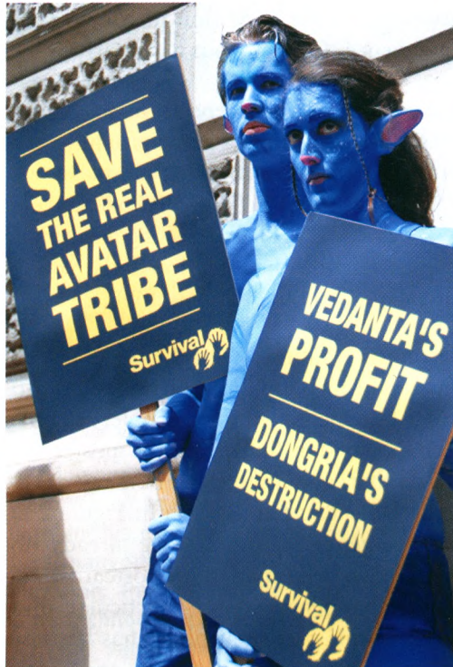
Figure 2.4 (d) two protestors at the annual general meeting of a mining company proposing to mine the sacred mountain of the Dongria Kondh tribe in India

Survival International supports the right of tribal peoples worldwide, helping to defend their lives, protect their lands and determine their own futures. For more information, films and photographs log onto www.survivalinternational.org