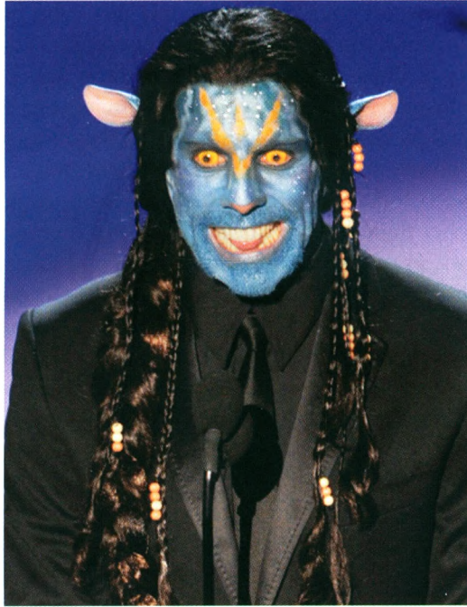
Figure 2.4 (c) Ben Stiller as a Na'vi, presenting the Oscar for Best Makeup in 2010