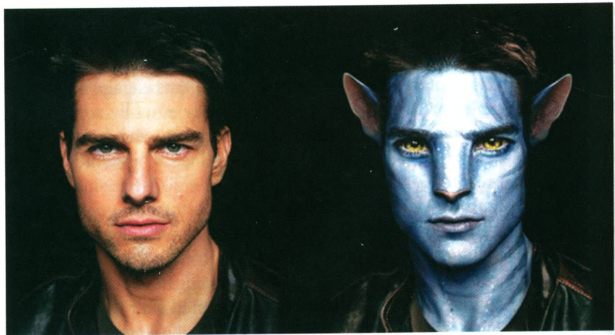
Figure 2.4 (b) an image from an online tutorial on how to turn any digital photo of a face into a Na'vi face using the photo editing software Photoshop