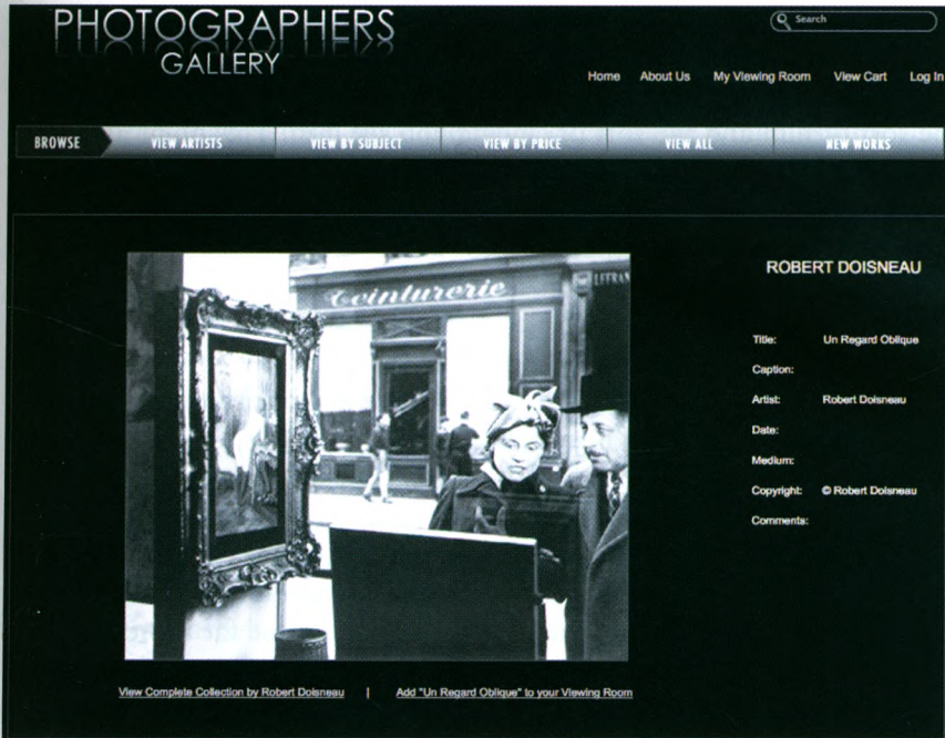
Figure 2.3 screenshot of photographers gallery.com

points out, an image on a digital screen is constantly being refreshed by screen hardware). At another level though they raise a number of other, more important questions about how an image is looked at differently in different contexts. You don't do the same things while you are surfing through a website gallery at home as you do when you are in a gallery looking at framed photograph. While you are looking at a computer screen you can also be listening to music, eating, comparing one site to another, answering the phone; in a gallery there will be no background music, you are expected to remain quiet, not to touch the pictures, not to eat ... again, the audiencing of an image thus appears very important to its meanings.